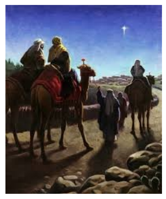
Wise Men Still Seek Him