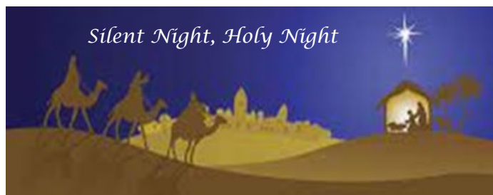
Silent Night, Holy Night