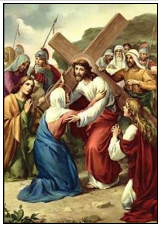
STATIONS OF THE CROSS, 4, 5 AND 6

Jesus, you feel so alone with all those people yelling and screaming at you. You don't like the words they are saying about you, and you look for a friendly face in the crowd. You see your mother. She can't make the hurting stop, but it helps to see that she is on your side, that she is suffering with you. She does understand and care.