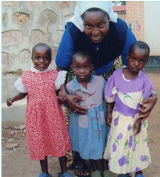
Sister with children at Angel Home

To learn more about Angel Home Orphanage and how you can help, visit our website at childrenofhopeandfaith.org