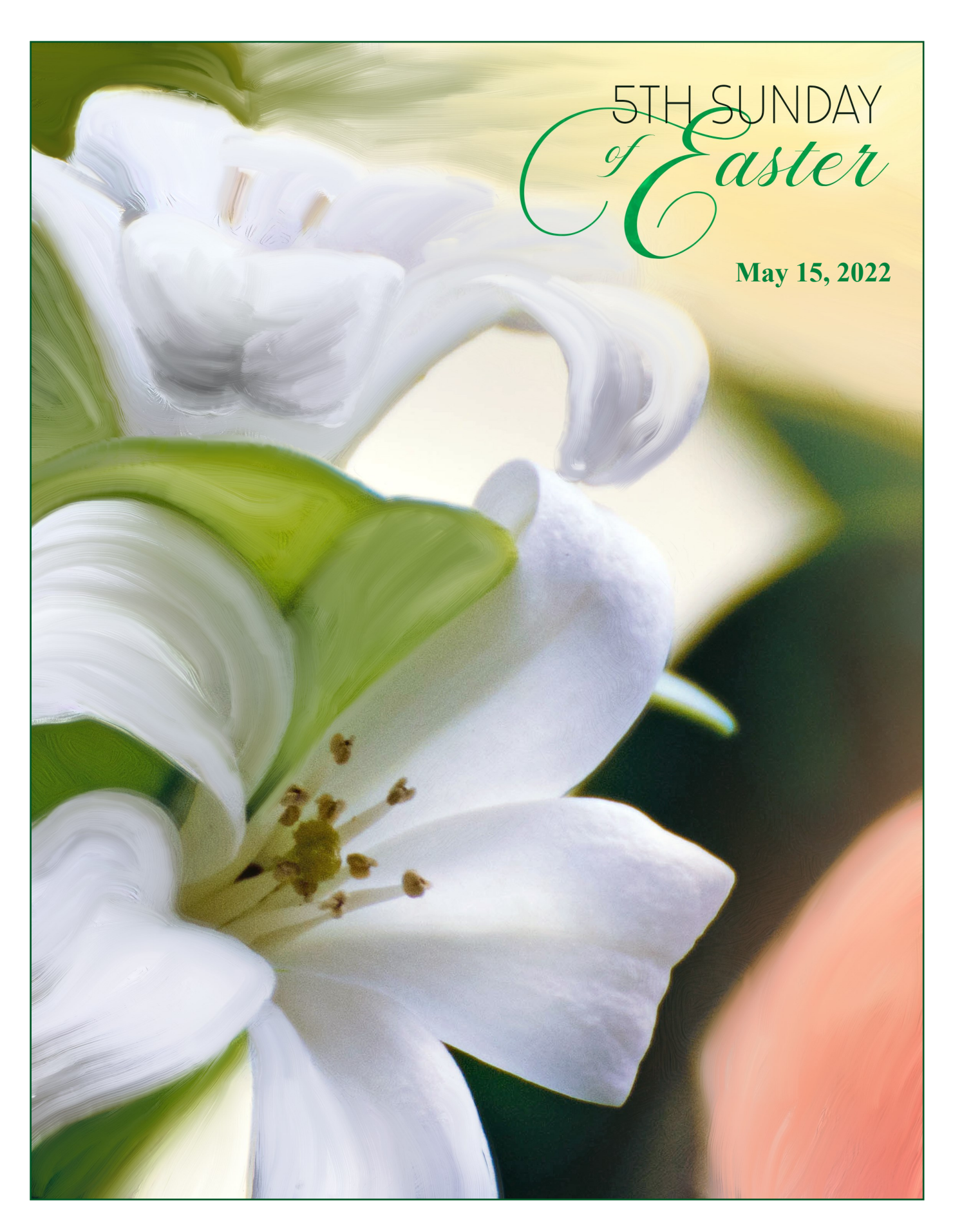
Church of the Exaltation of the Holy Cross