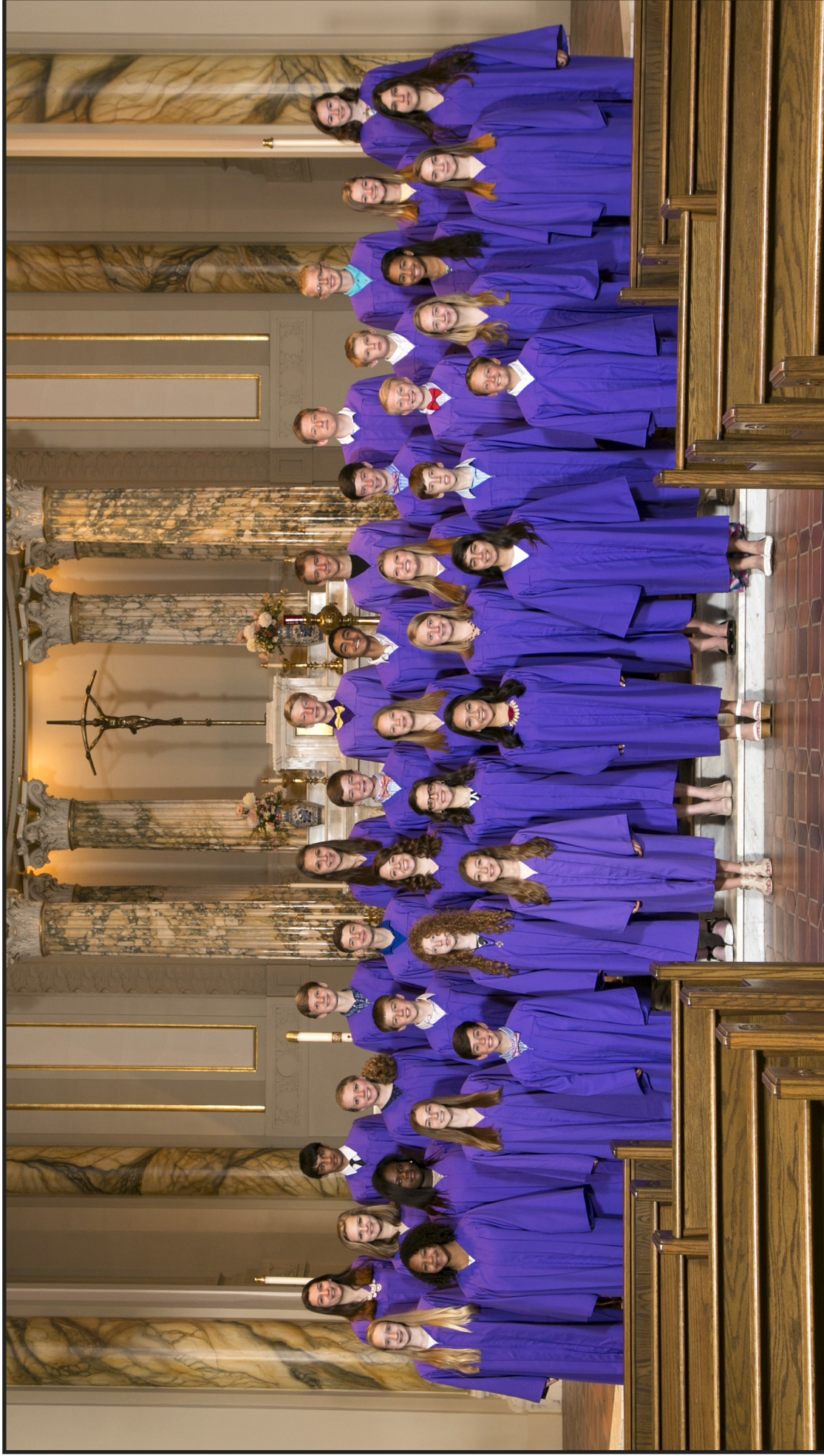
Holy Cross School Class of 2015 Graduation May 21, 2015