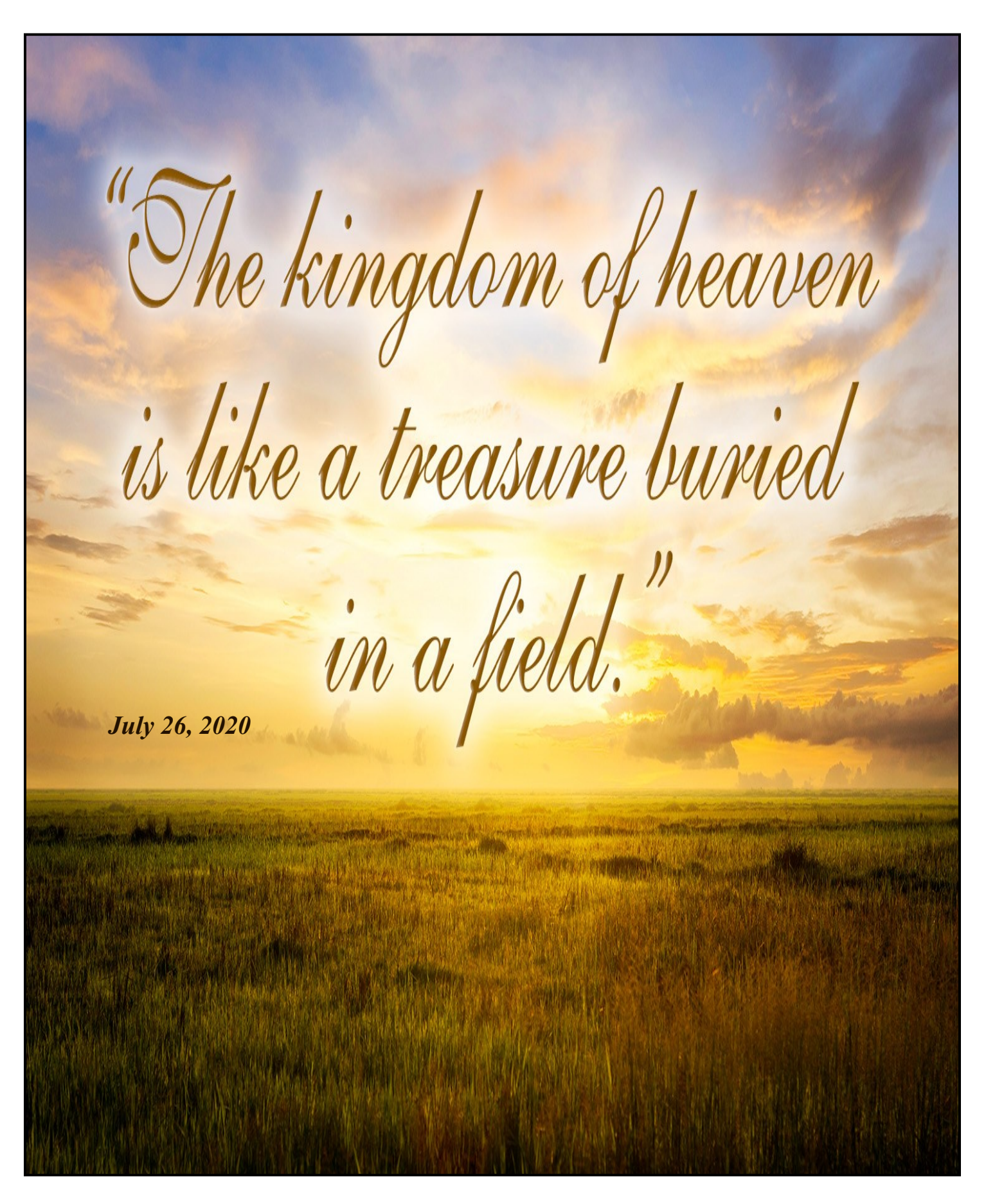
Church of the Exaltation of the Holy Cross