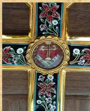
Relic from the True Cross from our own Holy Cross Parish

LET US THEN LEARN FROM THE CROSS OF JESUS OUR PROPER WAY OF LIVING. SHOULD I SAY 'LIVING' OR, INSTEAD, 'DYING'? RATHER, BOTH LIVING AND DYING. DYING TO THE WORLD, LIVING FOR GOD. DYING TO VICES AND LIVING BY THE VIRTUES. DYING TO THE FLESH BUT LIVING IN THE SPIRIT. THUS IN THE CROSS OF CHRIST, THERE IS DEATH AND IN THE CROSS OF CHRIST THERE IS LIFE. THE DEATH OF DEATH IS THERE AND THE LIFE OF LIFE. THE DEATH OF SINS IS THERE AND THE LIFE OF THE VIRTUES. THE DEATH OF THE FLESH IS THERE AND THE LIFE OF THE SPIRIT.