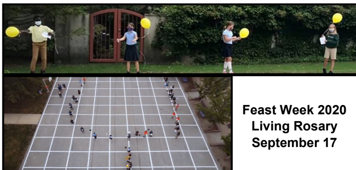
Feast Week 2020 Living Rosary September 17