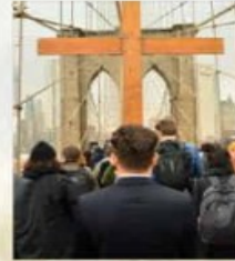
GENEROUS SINGLE LIFE