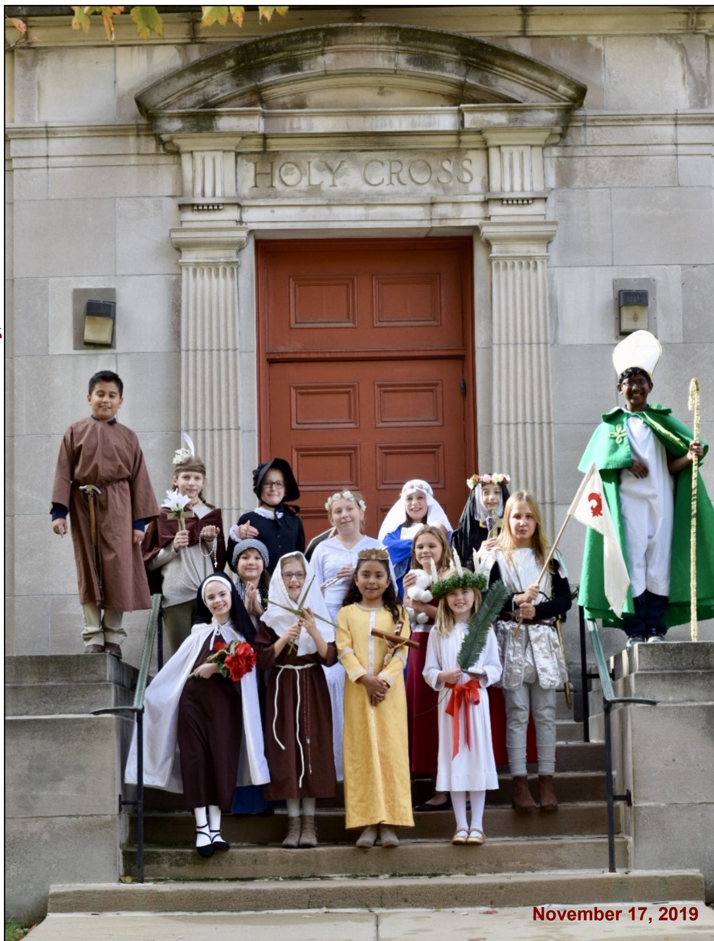
Church of the Exaltation of the Holy Cross