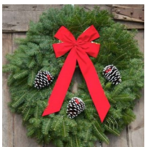
Classic Wreath $35

Troop 9 will be selling wreaths for the month of December. We will also have a booth setup at the parish center during coffee and doughnuts on December 18th. If you would like to order something, please reach out to the Committee Chair at committeet9@gmail.com or call 618-975-6687.