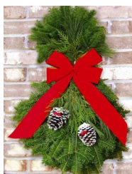
Classic Door Spray $30