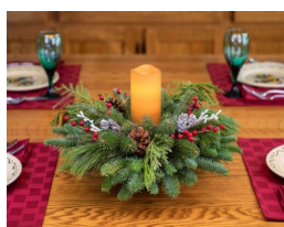
Candlelit Centerpiece $40