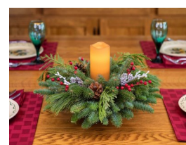
Candlelit Centerpiece $40