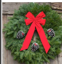
Classic Wreath $35

Troop 9 will be selling wreaths for the month of December. We will also have a booth setup at the parish center during coffee and doughnuts on December 18th. If you would like to order something, please reach out to the Committee Chair at committeet9@gmail.com or call 618-975-6687.