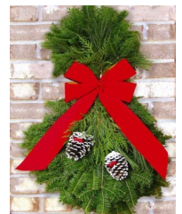
Classic Door Spray $30